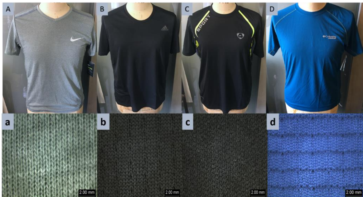
Figure 1. Appearance and fabric structure of fabric samples of different brands: Nike (A, a), Adidas (B, b), Laishilong (C, c) and Columbia (D, d).

The appearance and fabric structure of four samples were shown in Figure 1. Two samples, Nike and Adidas, were knitted by single jersey, while the other two samples, Laishilong and Columbia, were knitted by double jersey with specific techniques. The miss stitches were applied on the back body of Nike T-shirt to create the holes on the fabric. For the Adidas's T-shirt, there were two tensions of the double jersey applied on the front body of garment, thus to create subtle disruptive pattern. Its back body was knitted by plain single jersey but every three wales has constant tension and then one wale has different tension. The whole garment of the Laishilong's T-shirt was knitted by plain stitches. The fabric structure of Columbia's T-shirt was special knitted by every 5 wales of front loops with 1 wale of back loops. Also, every 5 courses plain stitches were knitted and followed with 1 course of tuck stitches. Therefore, the overall fabric structure of Columbia's T-shirt seems plaid pattern.